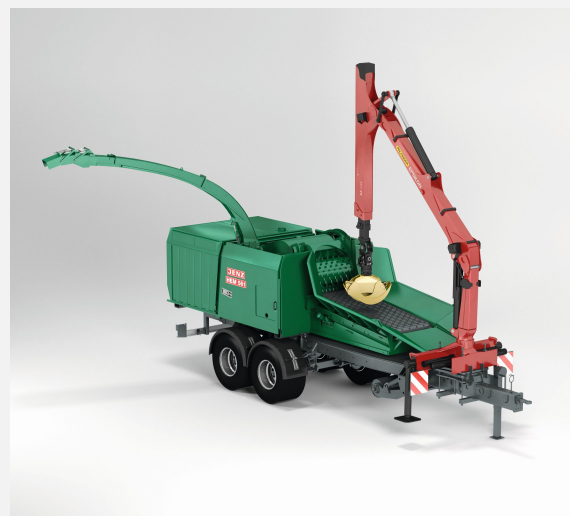
JENZ HEM561DL Log Chipper