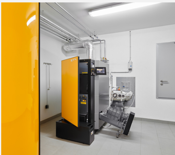
ETA eHACK Wood boiler