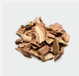
Fuel-grade wood chips